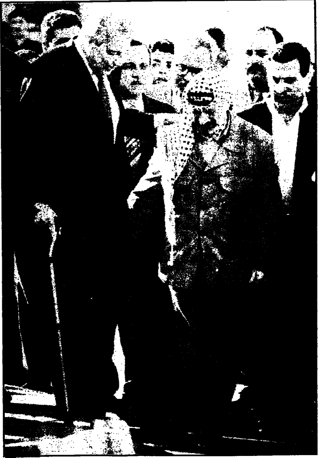
President Ezer Weizman leans on PA Chairman Yasser Arafat before their meeting at the Erez checkpoint yesterday.

the whole region." In response to reporters' questions, Arafat said: "I will fight terrorism wherever it is, including the confiscation of land and the demolition of housing."